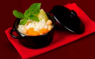
PLATE OF THE DAY (every day, a different one)